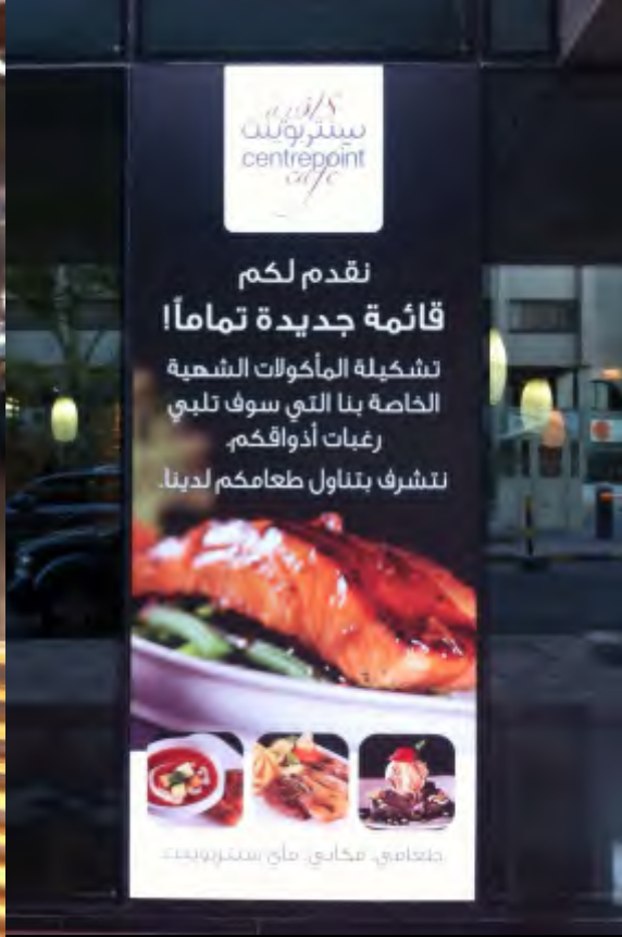
Vinyl Glass panels